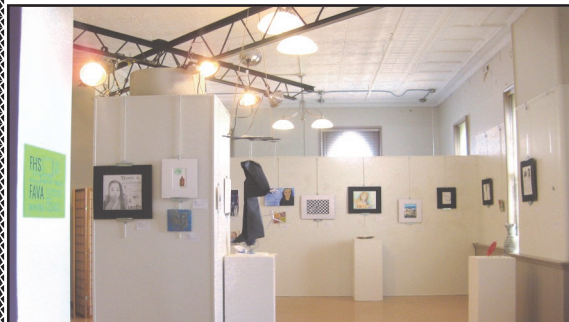
A view of the south gallery