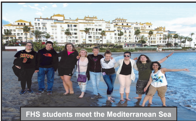
FHS students meet the Mediterranean Sea